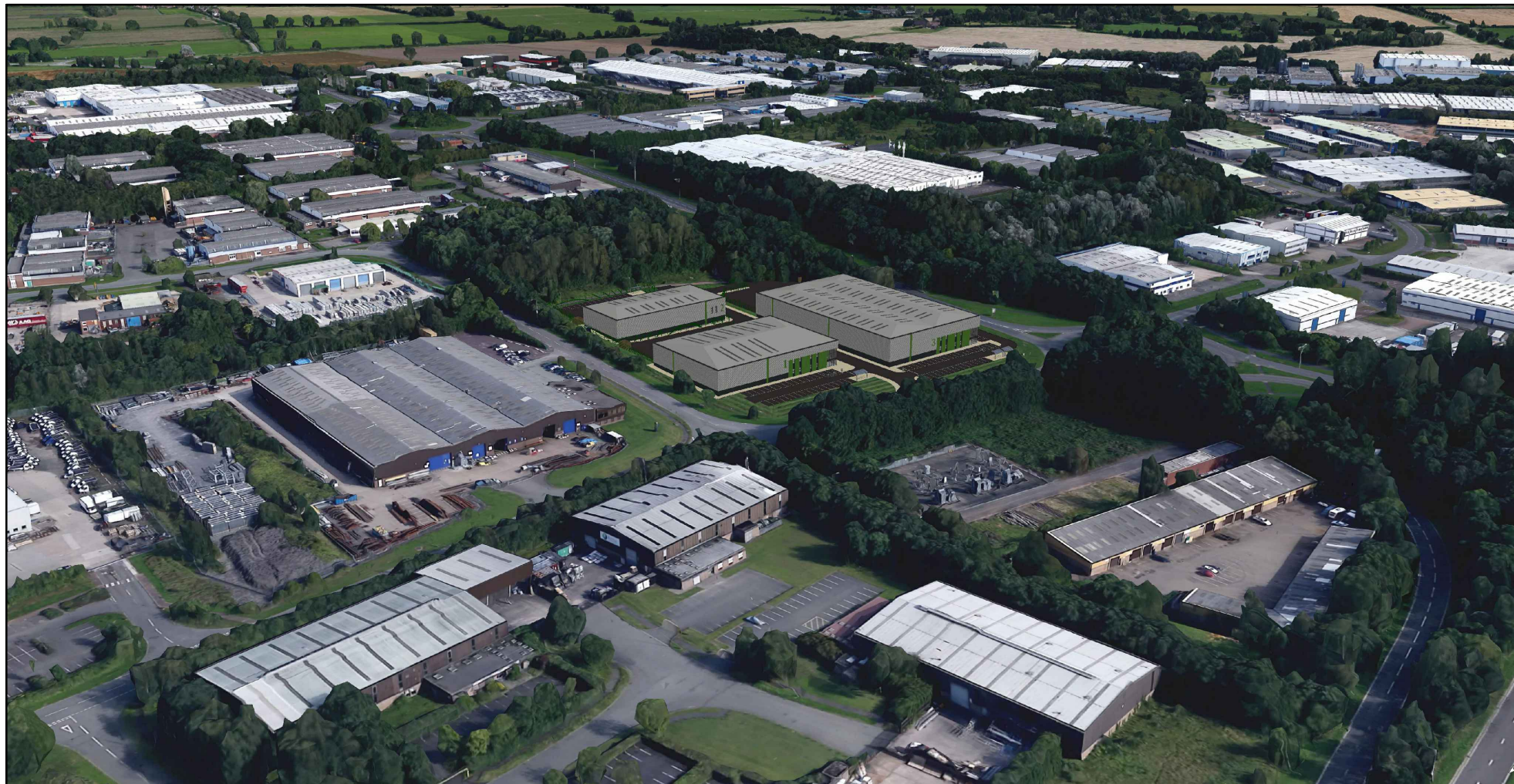
South East aerial view across the development